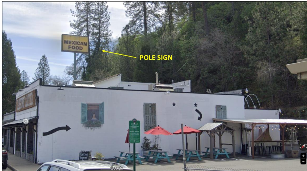
Figure 2. Pole Sign Location

The subject parcel has actively been in Code Enforcement since 2020, for unpermitted signage, outdoor dining, and loss of required on-site parking. Staff has been in communication with the property owners and business owners since 2020. A Site Plan Review (SPR) for the parcel (and Variance application) was submitted to the Development Services Department (DSD) in September 2023. Unfortunately, site and sign modifications following submittal rendered the application incomplete and an additional information request was sent to the business owners on November 9, 2023. Staff responded to the applicants' question on December 15, 2023, after which no communication was received until the next Notice of Violation was sent in May 2024.