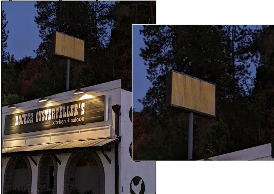
Figure 3. Pole Sign as of September 2024

Pursuant to Zoning Ordinance Section 10-4-17(B), an abandoned business is “ one that has not operated on a regular and active basis for a period of one hundred and eighty (180) days or more, during which the business advertised has not carried on those activities which are necessary and incidental to the operation of a business or like type or character. ” Similarly, an abandoned sign is one where the subject business advertised has not operated on-site for 180 days or the sign has been stripped of copy for greater than 180 days.